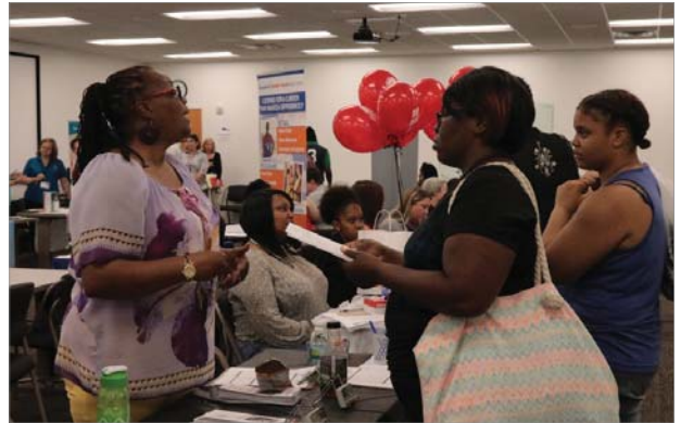
Employment candidates meet with providers at a MCBDDS-hosted Job Fair in June.

Since first meeting in the winter of 2017, the group has undertaken a number of activities, including a DSP Hiring Fair at The Job Center in Dayton and five Hiring Events held at County Board locations. The group shared information about job opportunities on WHIO-TV's public affairs program, "WHIO Reports," and offered input for a recruitment campaign the Ohio Provider Resource Association (OPRA) will kick off in November. They are also working with MCBDDS to find ways to extend OPRA's campaign through county boards' communications, and with MCBDDS and the Miami Valley Career Technology Center to produce 30 second promotional spots for social media that highlight the value and rewards of working with people with developmental disabilities. These efforts will get underway soon.