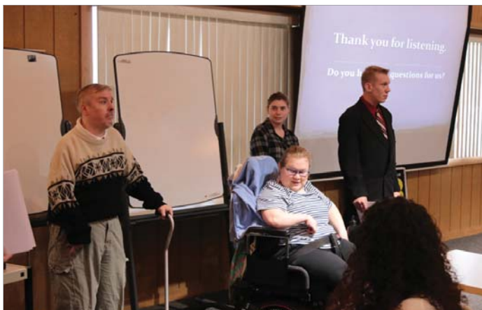
Self-advocates presented to their Service and Support Administrators in October.